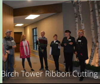
Birch Tower Ribbon Cutting