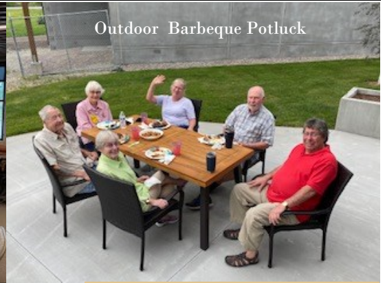
Outdoor Barbeque Potluck