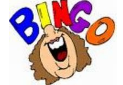
BINGO, Tuesday, March 29th @ 7pm

Join in after dinner for some good ol' fun. $8 to play.